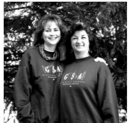
GSA Song tapes and note cards available too!